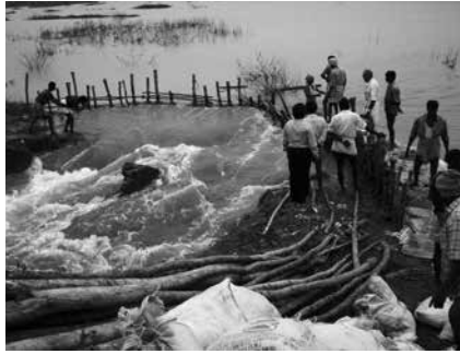
Floodwater entering the roads of Chennai, India. If Noah's Flood was only local, what would God's promise not to send a flood again mean?

Noah and company were on the Ark for one year and 10 days (Gen. 7:11, 8:14)—surely an excessive amount of time for any local flood? It was more than seven months before the tops of any mountains became visible. How could they drift around in a local flood for that long without seeing any mountains?