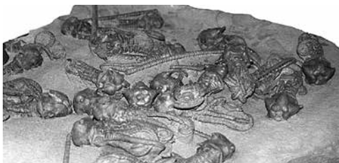
Fossil ‘graveyards’ around the world, where the bones of many animals were washed together, buried and fossilized, are evidence for a watery cataclysm like the Flood.

There is abundant evidence that many of the rock strata were laid down quickly, one after the other, without significant time breaks between them. Preservation of animal tracks, ripple marks, and even raindrop marks testifies to rapid covering of these features to enable their preservation. Polystrate fossils (ones which traverse many strata) speak of very quick deposition of the strata. The scarcity of erosion, soil formation, animal burrows, and roots between layers also shows they must have been deposited in quick succession. The radical deformation of thick layers of sediment without evidence of cracking or melting also shows how all the layers must have been still soft when they were bent.